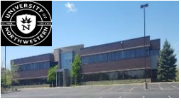
Veritas Office Bldg.

Represented Buyer in Sale Transaction $8,900,000