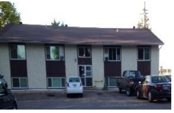
Rush City Apartments

Represented Seller in Sale Transaction $1,100,000