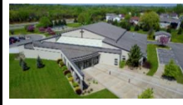
Southland City Church

Represented Buyer in Sale Transaction $4,000,000