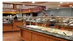
Old Country Buffet

Represented Tenant in Lease Transaction & Equipment Acquisition $1,500,000