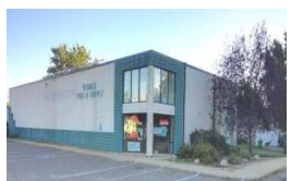
Thomas Tool Supply

Represented Seller in Real Estate Sale Transaction