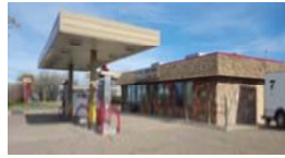
Mr. B's Car Wash & Store

Represented Seller in Sale Transaction $1,000,000